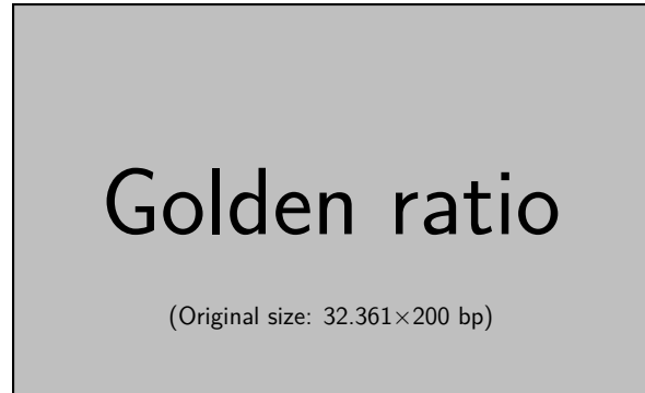
Figure 1: A figure with a caption that runs for more than one line. Example image is usually available through the mwe package without even mentioning it in the preamble.

How are you evaluating your model? What results do you have so far? What are your baselines? Refer to item 5. This may take around 0.5 pages.